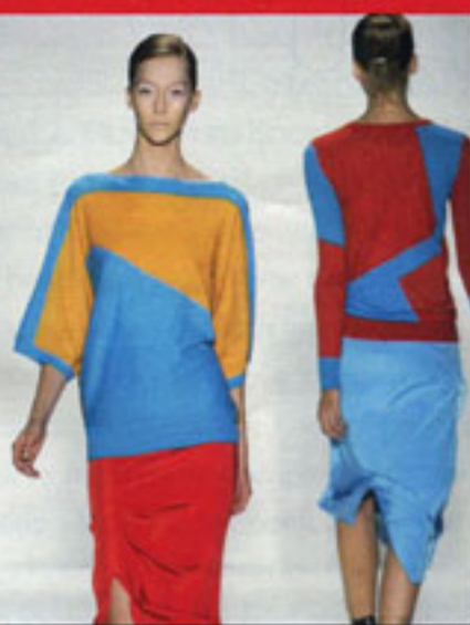
Right on hue: designer Prabal Gurung